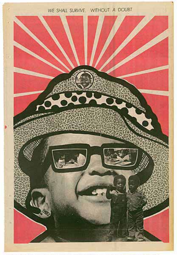
Emory Douglas, poster from The Black Panther , August 21, 1971, offset lithograph, Collection of Alden and Mary Kimbrough, Los Angeles, © Emory Douglas, digital imaging by Echelon

Figure 3. "We shall survive. Without a doubt." By Emory Douglas. Used courtesy of Urbis.