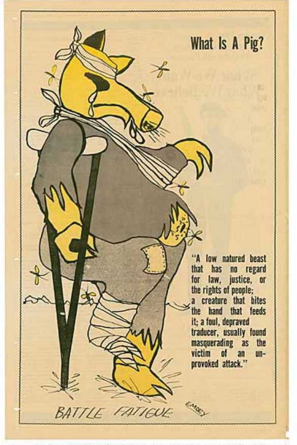
Emory Douglas, poster from The Black Panther , December 20, 1967, offset lithograph, Collection of Alden and Mary Kimbrough, Los Angeles, © Emory Douglas

entire nation states.<sup>6</sup> Through the pig, the problems of the ghetto were connected to wider international issues and the American government's treatment of the black