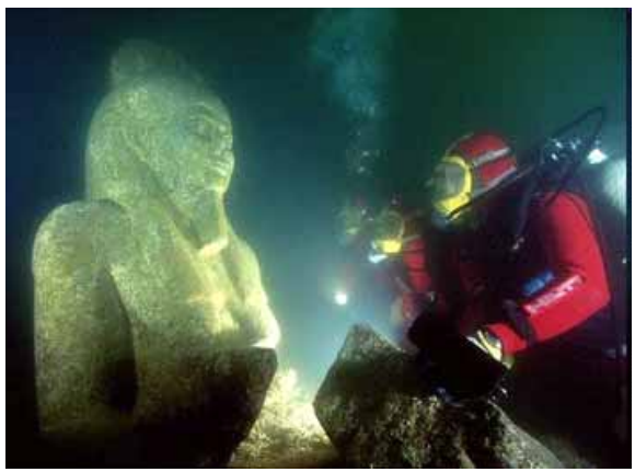
Figure 3. Artifact recovery: Undersea environment preserved artifacts from natural disintegration and looting.

were begun by the European Institute for Marine Archaeology. It is the objects recovered by these investigations that were exhibited. I wonder, when the archaeologists of the future find our sunken civilization, what will they exhibit in their museums. Or is it too optimistic to assume that there will be museums?