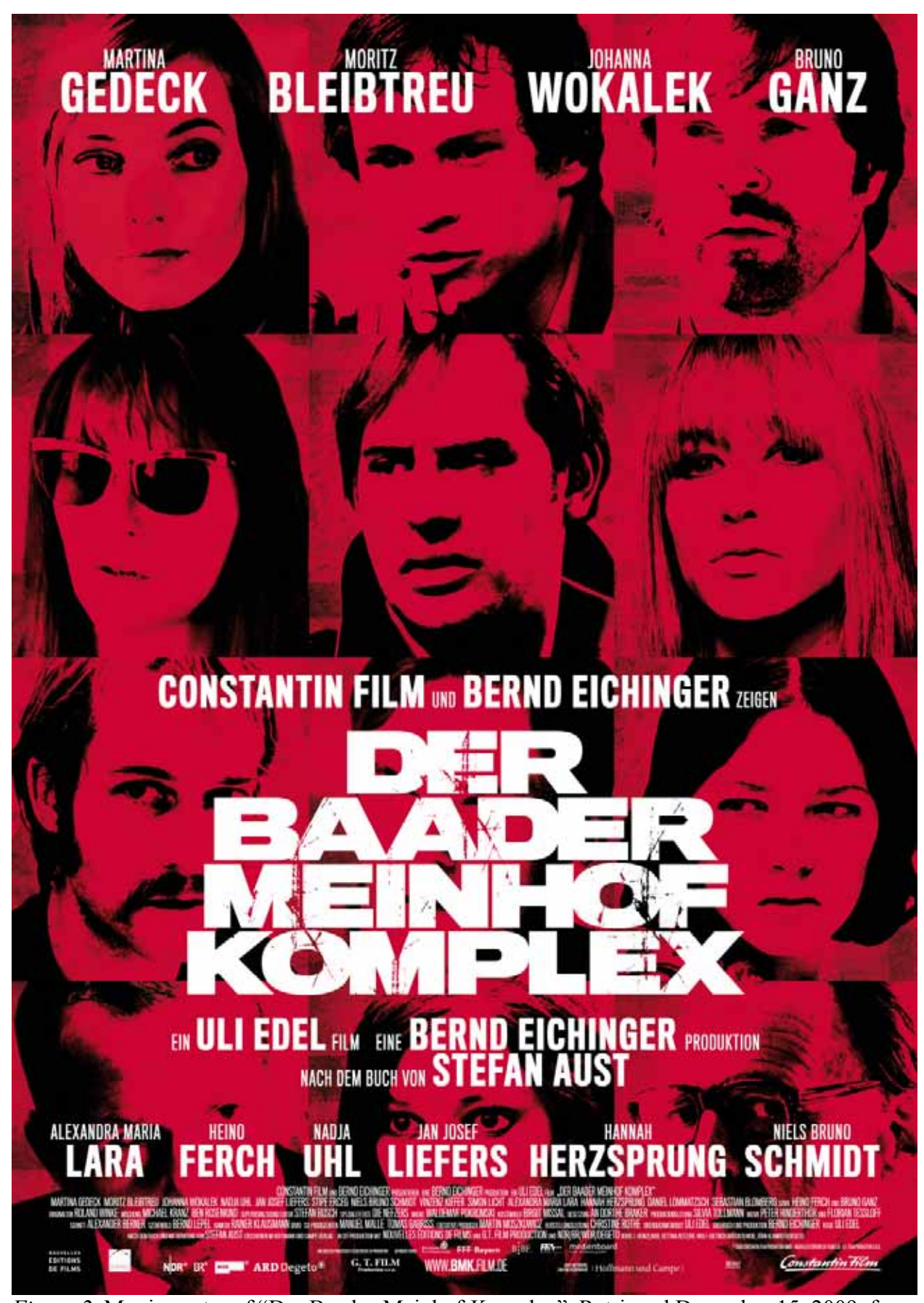
Figure 2. Movie poster of "Der Baader-Meinhof-Komplex".