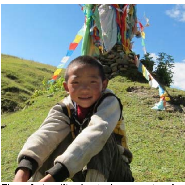
Figure 2. A smiling boy in the mountains of Tibet .

Turkey. Figure 2 is one of those images, and we highly recommend taking a look!