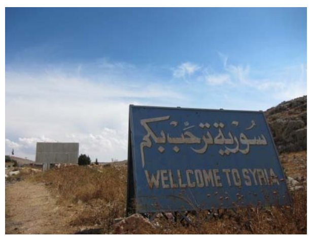
Figure 1. At the Syrian border.

In addition to the main blog page, Mr. Nagata has added a new feature titled "Chain of Smiles" that shows some of the smiling visages he has encountered in his travels. At present it includes smiles from Thailand, India, India, China, Hungary, Egypt, and