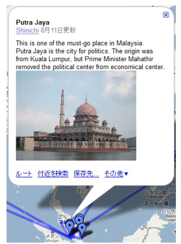
Figure 3. The commentary for Putra Jaya.

A careful look at the figures will reveal that Mr. Nagata is using Google Maps in Japanese (e.g., the hyperlinks in Figure 3 are in Japanese). The mapmaker can choose his or her preferred language for such administrative functions, which means that even beginning students of a second or foreign language can address administrative tasks in their preferred (likely native) language. The same is true for Wordpress, the blogging software which Mr.