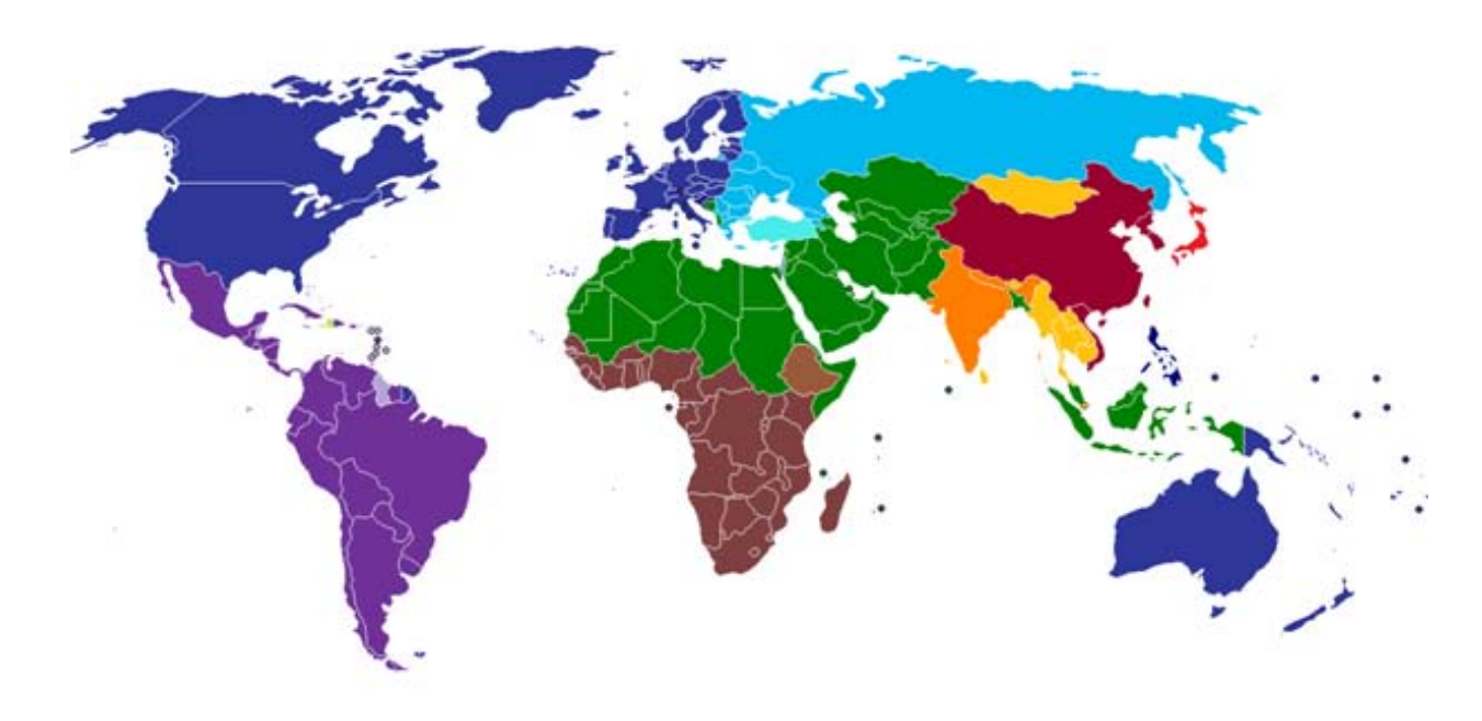
Figure 1. The world according to Huntington

Note: The eight civilizations include (1) Western (dark blue), (2) Confucian (dark red), (3) Japanese (bright red), (4) Islamic (green), (5) Hindu (orange), (6) Slavic Orthodox (mediumlight blue), (7) Latin America (purple), and (8) African (brown). The remaining colors indicate countries which do not fit into Huntington's system of eight major civilizations, most notably Southeast Asia, Mongolia, and Turkey.